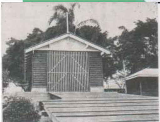
The 1937 Rowing Shed and Pontoon