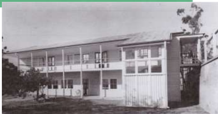
The 1952 "M" Rooms