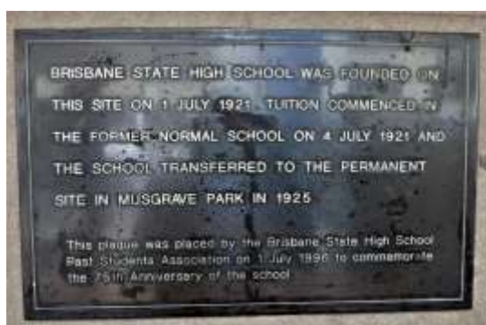
The Normal School Foundation Stone Commemorative Plaque Opening Plaque